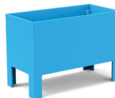
sky: color code SB