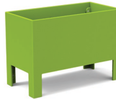
leaf: color code LG