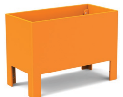
sunset: color code OR