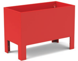
apple red: color code AR