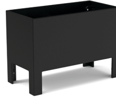
black: color code BL

shipped flat packed some assembly required