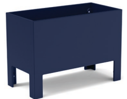
navy blue: color code NB