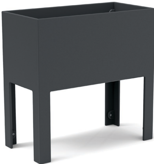
elevated planter 20