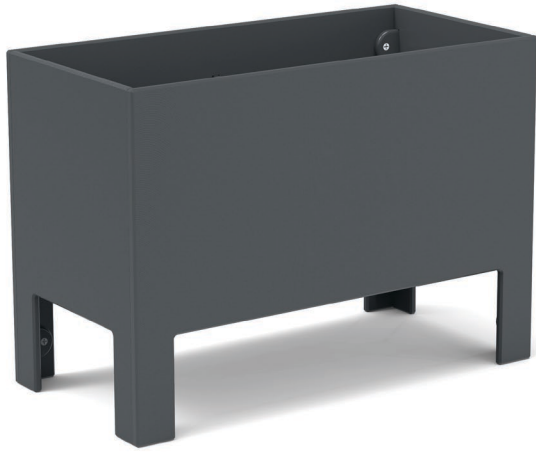
elevated planter 20