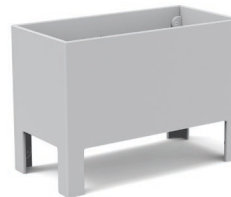
driftwood: color code DW