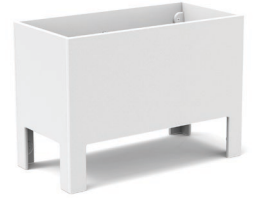
cloud: color code CW