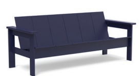
navy blue: HN-H3S-NB