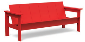
apple red: HN-H3S-AR